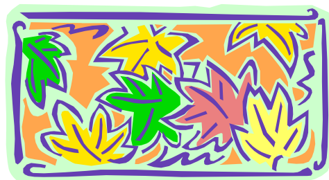
Thanks for your ongoing support of Sunset Park.

We are asking each child to bring in $3.00 for the baskets and we will begin collecting cakes for the cake walk on the Monday of Festival week. Pre-sale tickets for baskets and games will begin the morning of the 9th in the commons of Sunset Park. You can get unlimited bounce wrist bands at this time as well. If you want the best deal make sure to take advantage of the pre-sale prices as the cost will go up after Friday morning. We sure hope you can join us at the Fall Festival. It is sure to be a great time for all. For questions call 549-7610. Thanks.